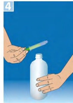
Remove the syringe