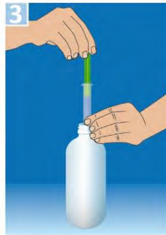
Withdraw the desired volume