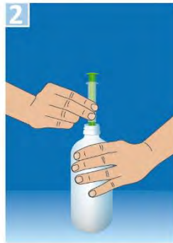
Connect the syringe