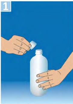
Remove the cap