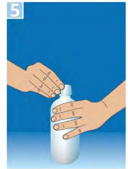
Close the cap

2. Pouring out the solution (without syringe) is also possible.